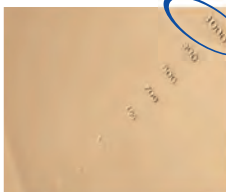
Calibration markings on the inside wall