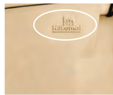
Provision for embossing customer logo